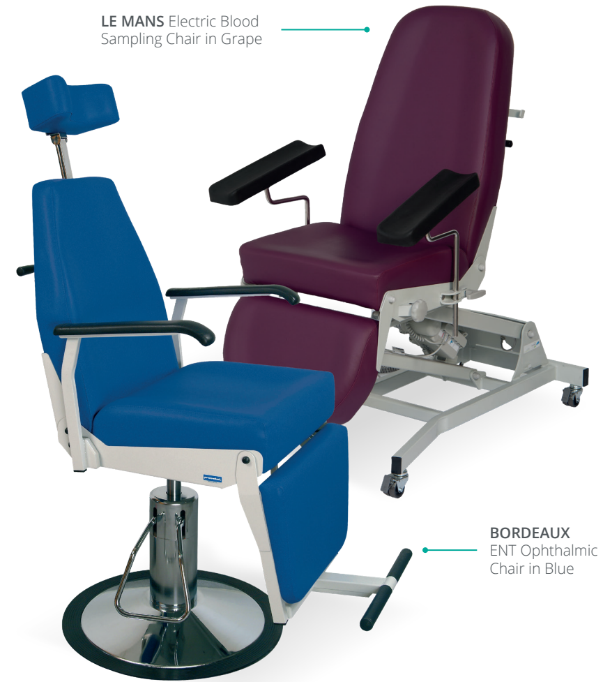
LE MANS Electric Blood Sampling Chair in Grape