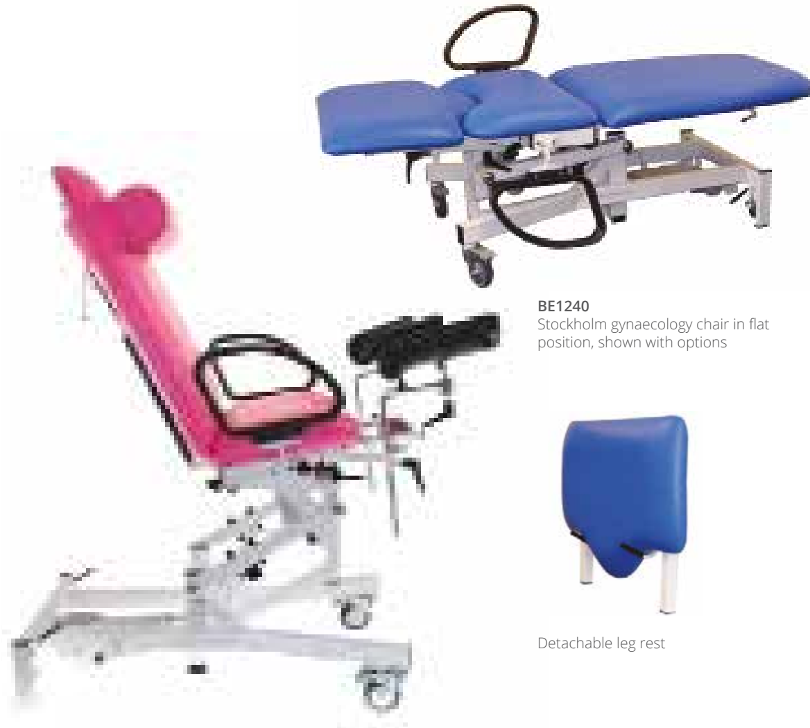
BE1240 Stockholm gynaecology chair in flat position, shown with options

Practical and simple, the Stockholm is an excellent cost effective choice offering key features such as electrical height and tilt adjustment, easy clinician access, detachable leg support and the ability for it to be transformed to a couch when the leg support is attached.