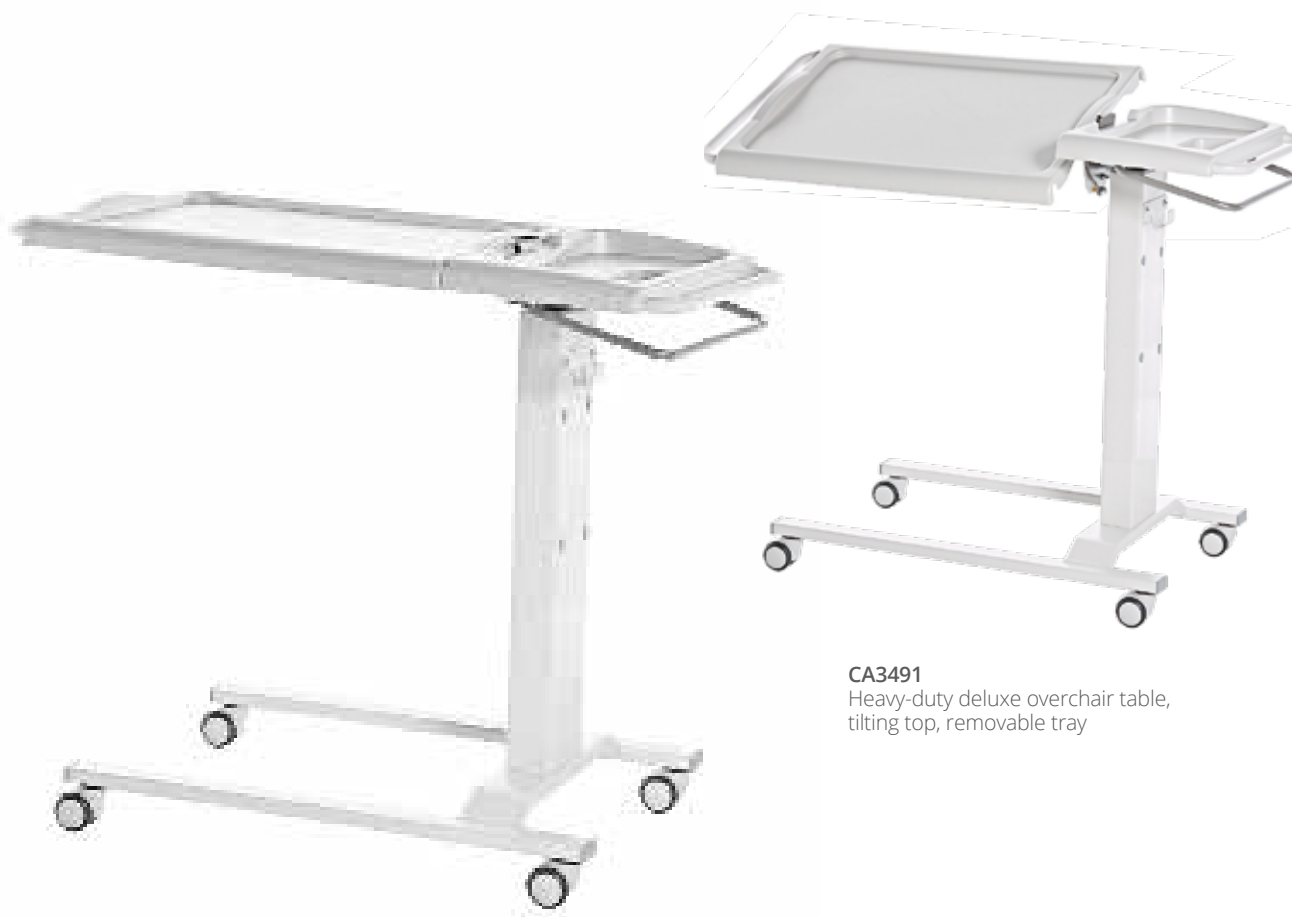
CA3490 Heavy-duty deluxe overchair table, removable tray

The epitome of functionality, stability and quality, our Deluxe overbed tables and overchair table have been meticulously designed to ensure they meet the most stringent patient and medical staff requirements. The durable, quality frame is combined with smooth-running castors to ensure the table is easy to move while still safely holding loads of up to 30kg. Powerful pneumatic springs make it easy to gently adjust the height of the tray with one hand and provides added safety if the patient is in the emergency Trendelenburg position. The removable trays have recessed grips and are the perfect size for holding meal trays, patient items, clinical accessories and disinfectants. The tough, resistant surface is quick and easy to clean. Also available with an adjustable rotating tabletop.