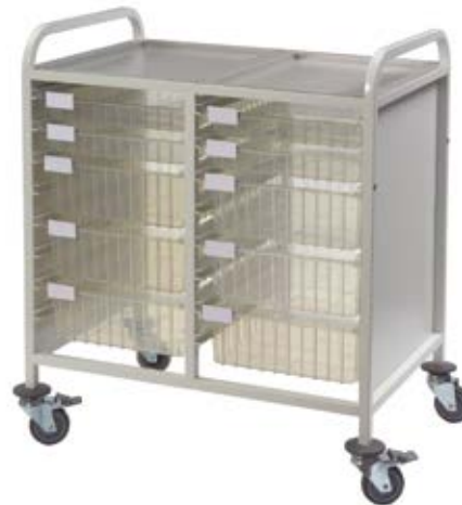
CA42224S6D Multi-Store double-width procedure trolley, standard height with 4 shallow and 6 deep trays, push handles