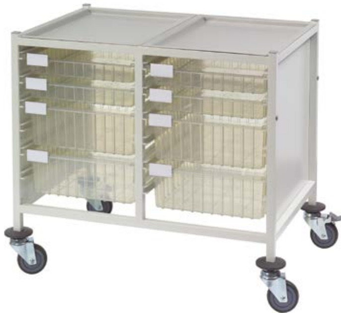
CA42234S4D Multi-Store double-width procedure trolley, low height with 4 shallow and 4 deep trays

Our multi-Store double-width trolley is ideal for maximum storage and transportation of equipment and consumables, this option offers twice the capacity as our standard versions. Supplied with labels and holders as a visible solution to department storage. The frame is welded together for premium quality with metal runners to ensure durability and longevity. With two push handles available on the standard height model and enclosed sides with a removable plastic top, this trolley can be cleaned with ease. Low and deep trays are an option along with dividers and a range of accessories to customise the trolley to the user's needs.