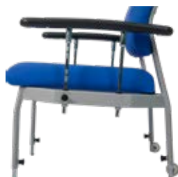
CA3247 Arvada high back patient chair with drop arms and housekeeping wheels