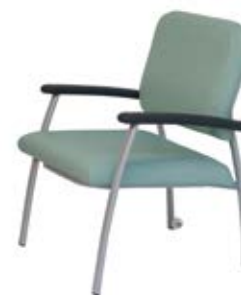
CA3259 Arvada mid back bariatric patient chair. Weight capacity: 300kg (47 stone)