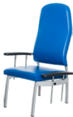
CA3248 Arvada high back patient chair with drop arms