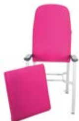
All models Removable seat for ease of cleaning