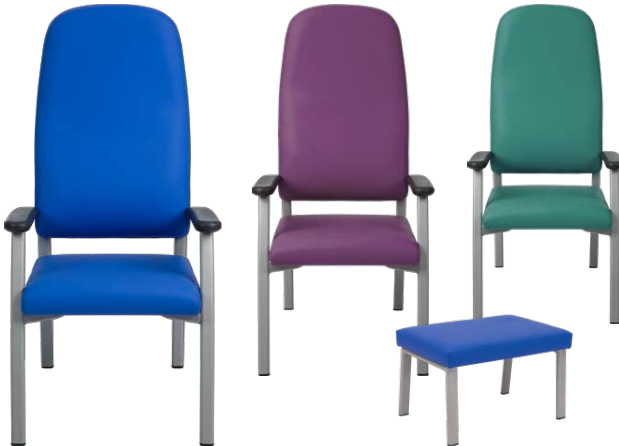
CA3250 Arvada high back patient chair

Focusing on a family of chairs, the Arvada is designed with an emphasis on premium support for the patient followed by comfort. The robust strong metal frame will withstand many years of maintenance-free use, while the removable seat cushion and clean lines are the perfect solution for supporting infection control. The Arvada is available in a range of options including a model with height-adjustable armrests, ideal for wheelchair users and patients who require easy side access. Both armrests are easily adjustable to be positioned at varying heights, allowing the patient to configure the chair to their optimum comfort. High and low-back options also available, including height-adjustable and bariatric models.