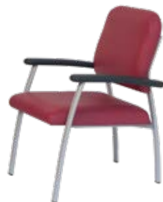
CA3255 Arvada mid back patient chair