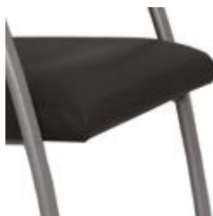
CA3252 Pressure care seat cushion