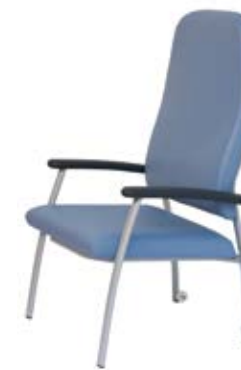
CA3258 Arvada high back bariatric patient chair with housekeeping wheels. Weight capacity: 300kg (47 stone)