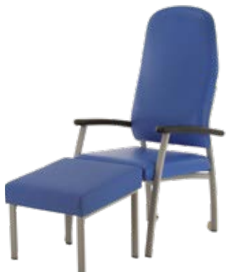
CA3251 Arvada high back patient chair with housekeeping wheels (shown with Arvada leg rest)