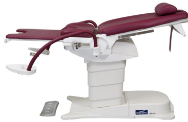
BE1206 Shown with accessory options