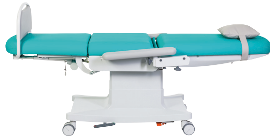
CA1815 Verona deluxe therapy chair in bed position