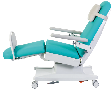
CA1815 Verona deluxe therapy chair in relax position