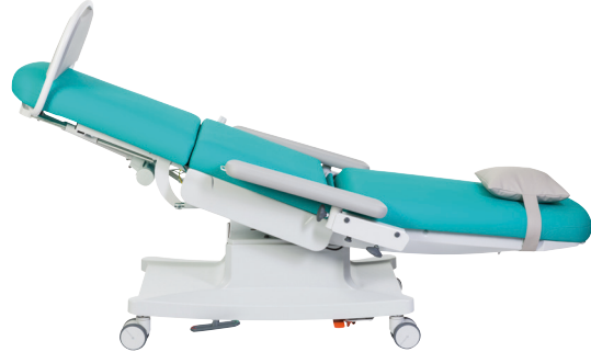
CA1815 Verona deluxe therapy chair in Trendelenburg position