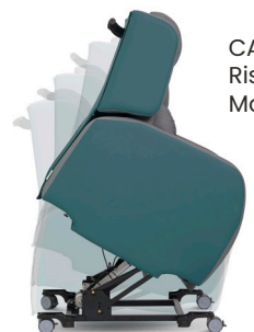
CA2006 Rise Movement