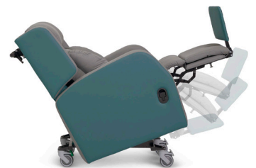
CA2007 Seat Tilt Footplate Movement