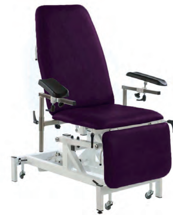
BE3195 Hydraulic phlebotomy couch

Our variable height-adjustable phlebotomy couch comes equipped with two fully adjustable blood sampling armrests for patient comfort and easy access.