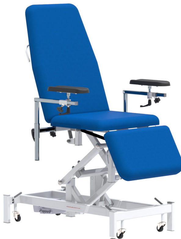
BE3200 Electric phlebotomy couch

Our variable height-adjustable phlebotomy couch comes equipped with two fully adjustable blood sampling armrests for patient comfort and easy access.