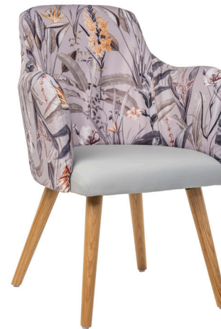
Shown in Ochre/Auster