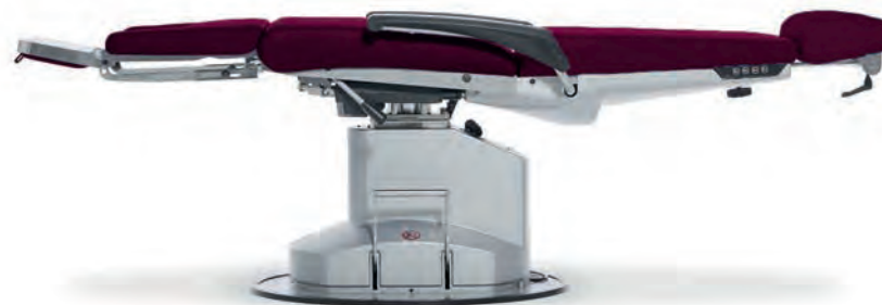
BE1166 Fully reclined position