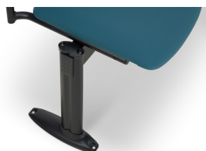
Floor fixed leg design