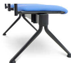
Freestanding leg design

*All dimensions do not include armrests when fitted