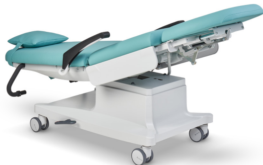
BE1275 Ferrara treatment chair, in the Trendelenburg position