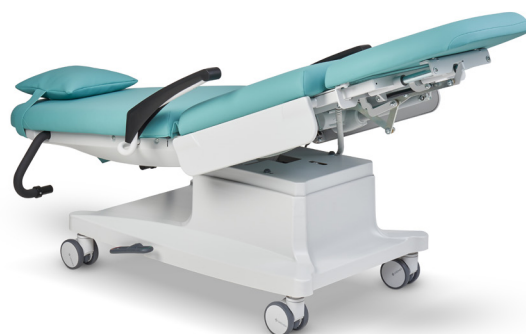
BE1275 Ferrara treatment chair, in the Trendelenburg position