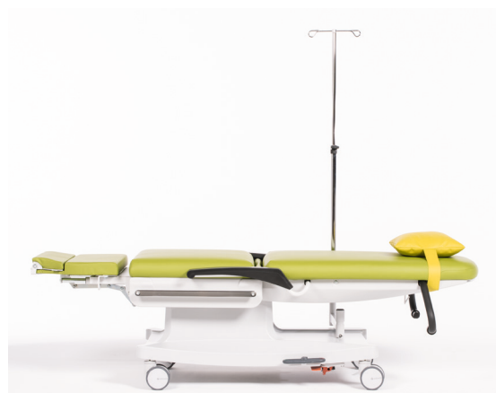
BE1275 Ferrara treatment chair, in the flat position, shown with accessories