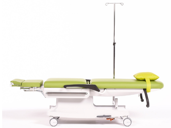
BE1275 Ferrara treatment chair, in the flat position, shown with accessories