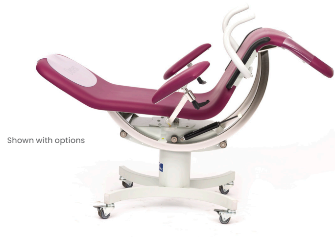
Shown with options

“The modern design of Deneo is better for our customers. They look professional and fit the very high standard here.”