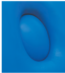
CA5062 Breathe hole