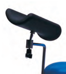
BE3310 Gynae knee troughs