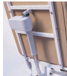
BE3306 Electric backrest