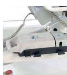
BE3309 Battery operating system