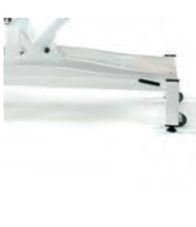
BE3326 Clean-edge base cover