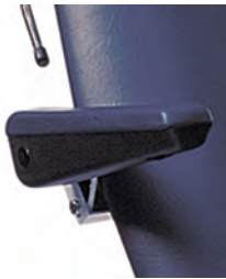
BE3313/BE3308 Standard/Bariatric armrests