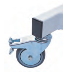
BE3317 Transportation castors