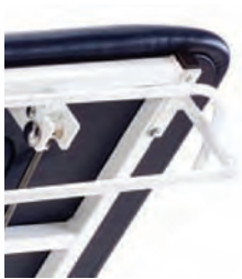
BE3302 Paper roll holder