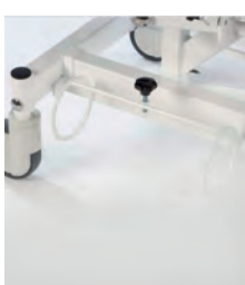
BE3320 Oxygen bottle holder