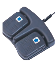
BE3305/BE3307/ BE3311 Foot switch (3 types)