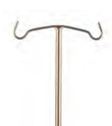
BE3325 IV pole (chrome)