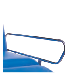
BE3304/BE3316 Cot sides – white/ chrome