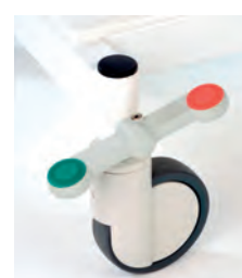
BE3324 Linked castor system