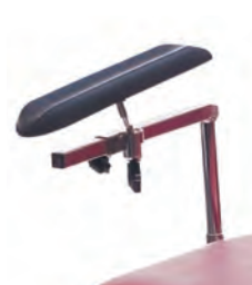
BE3314 Phlebotomy armrests