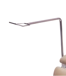
BE3312 Gynae stirrups