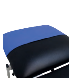
BE3327 Vinyl foot section cover