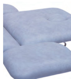
BE3318 Arm support tables