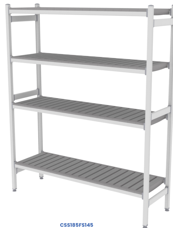
CSS185FS145 Clini-Store mobile 4-shelf unit on lockable castors, 600x1450mm, 250kg total capacity