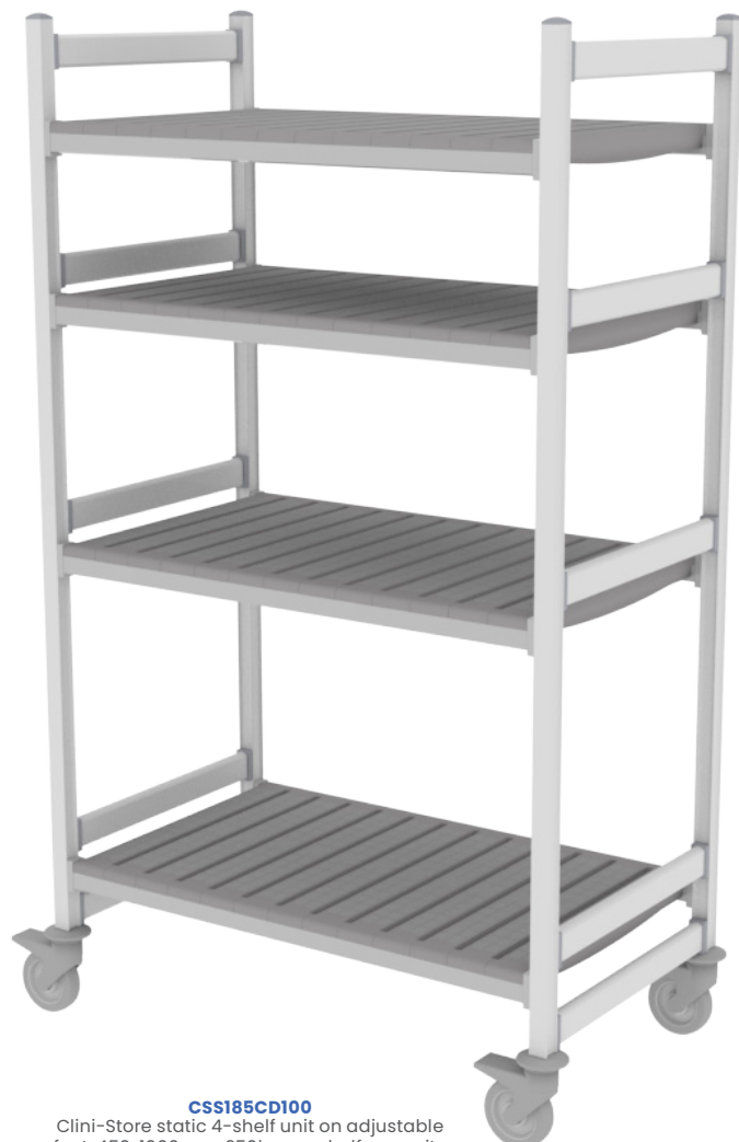
CSS185CD100 Clini-Store static 4-shelf unit on adjustable feet, 450x1000mm, 250kg per shelf capacity

Clini-Store static or mobile – the only shelving you will ever need. For easy-clean medical shelving in either stationary units with an unbelievable capacity of up 1000kg per unit, or mobile with a capacity of 250kg per unit, you need look no further.