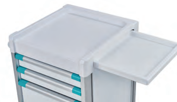
Pull out tray

Please see page 89 for a full range of accessories. Please note, if you wish to install any accessories to your Clini-Cart® Emergency Resus Trolley, these must be included in your order. We are unfortunately unable to retrofit accessories to the trolleys once they have completed production.