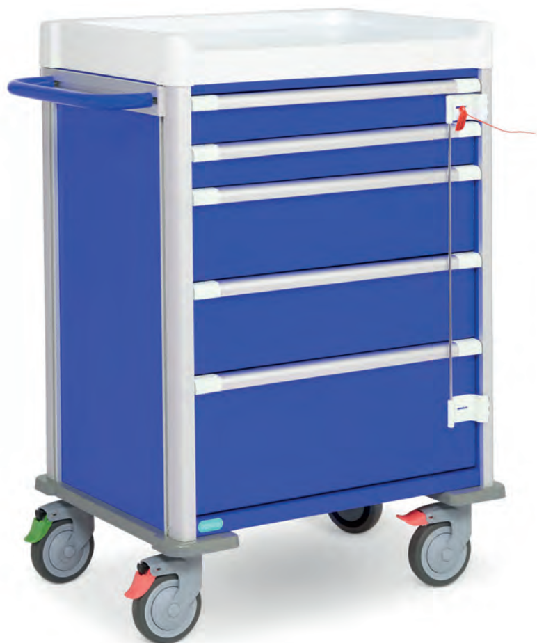
Standard width version