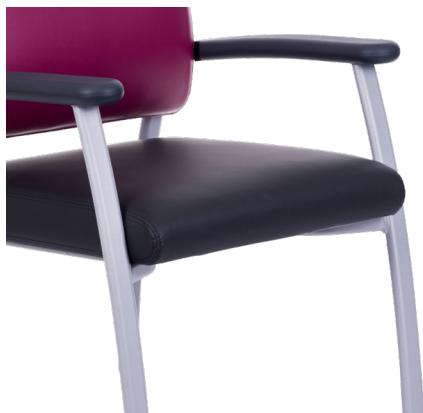
Pressure Care seat cushion