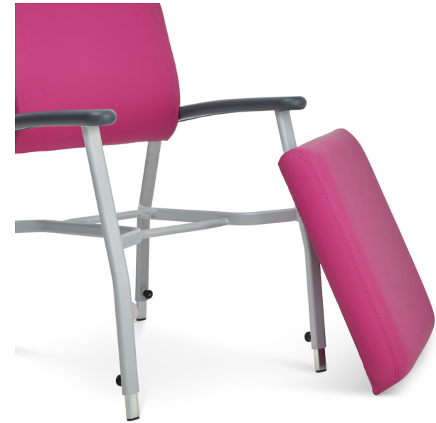
Removable Seat Cushion