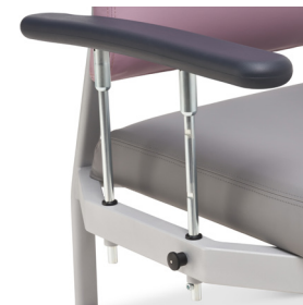
Height-adjustable Arms that drop flush with the top of the seat