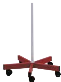
Berry base option