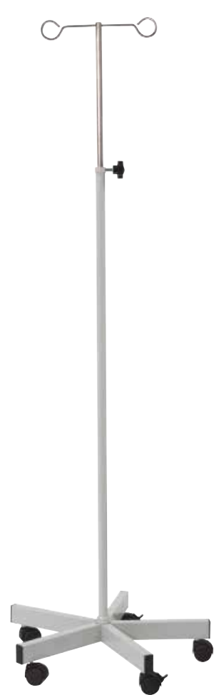
CA3410 Mild Steel Infusion Stand, 2 hook, 50mm castors, weighted base

A mild steel drip stand which is high-quality and competitively priced. Our infusion stands provide great stability for patients who are receiving intravenous fluids. The upper poles and hooks are constructed from 304 grade stainless steel and are height-adjustable. Available in a two and four hook version.