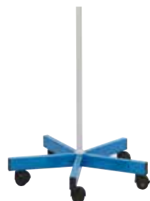
Atlantic base option