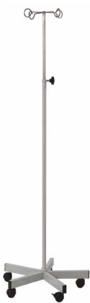
CA3415 Mild Steel Infusion Stand, 4 hook, 50mm castors, weighted base