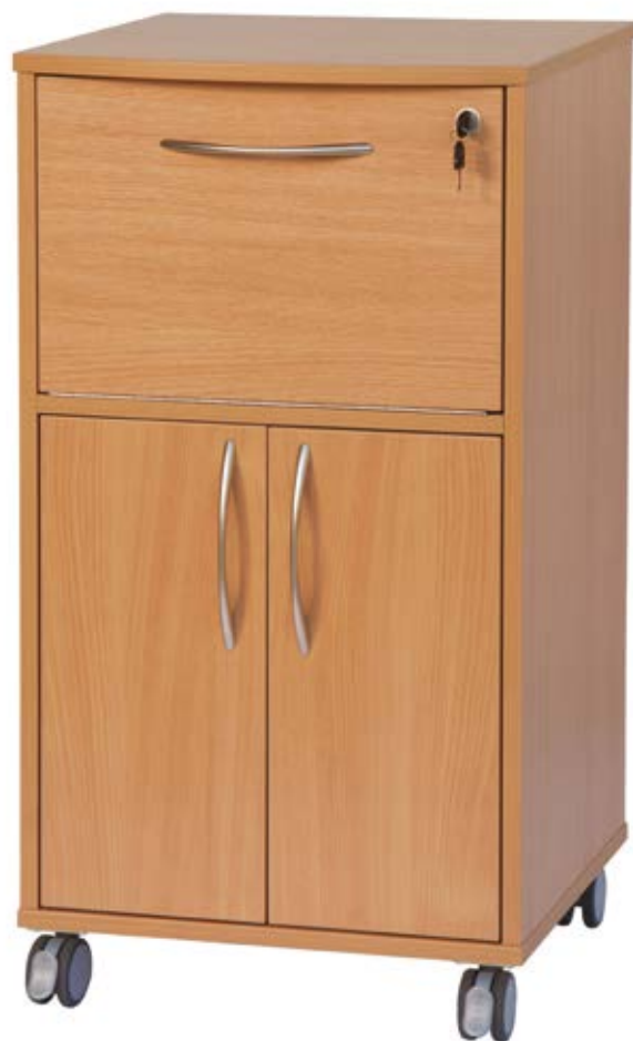
CA3940BE Dominica bedside cabinet in melamine, with upper and lower cupboards, Beech

Focusing on strong construction and durability, the Dominica range of bedside cabinets is the perfect accompaniment to any bedside. Providing ample secure storage space, it's the perfect choice for patients and ward staff. Supplied with quality brake castors, lockable upper storage and a lower cupboard with adjustable shelves.