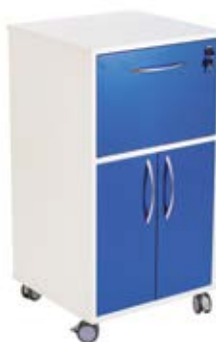
CA3940AT Dominica bedside cabinet in melamine, with upper and lower cupboards, Atlantic Blue