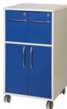
CA3942AT Dominica bedside cabinet in melamine, with two upper drawers and lower cupboard, Atlantic Blue