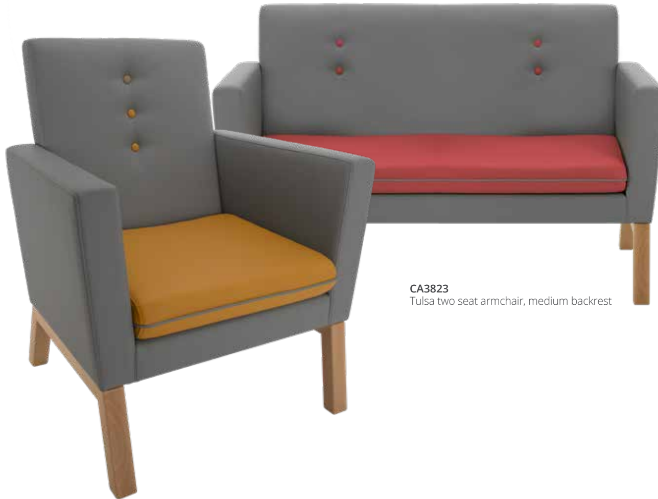
CA3823 Tulsa two seat armchair, medium backrest