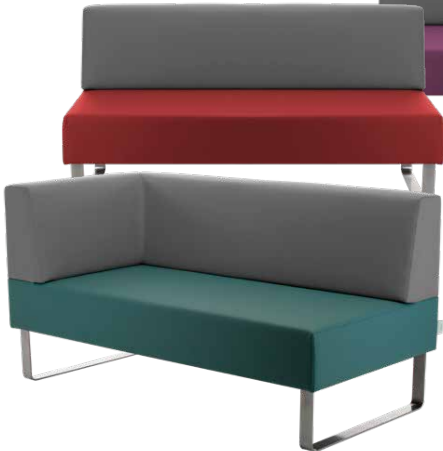
CA3838 Detroit double seat upholstered chair with right hand arm