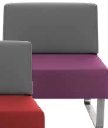
CA3833 Detroit single seat upholstered chair