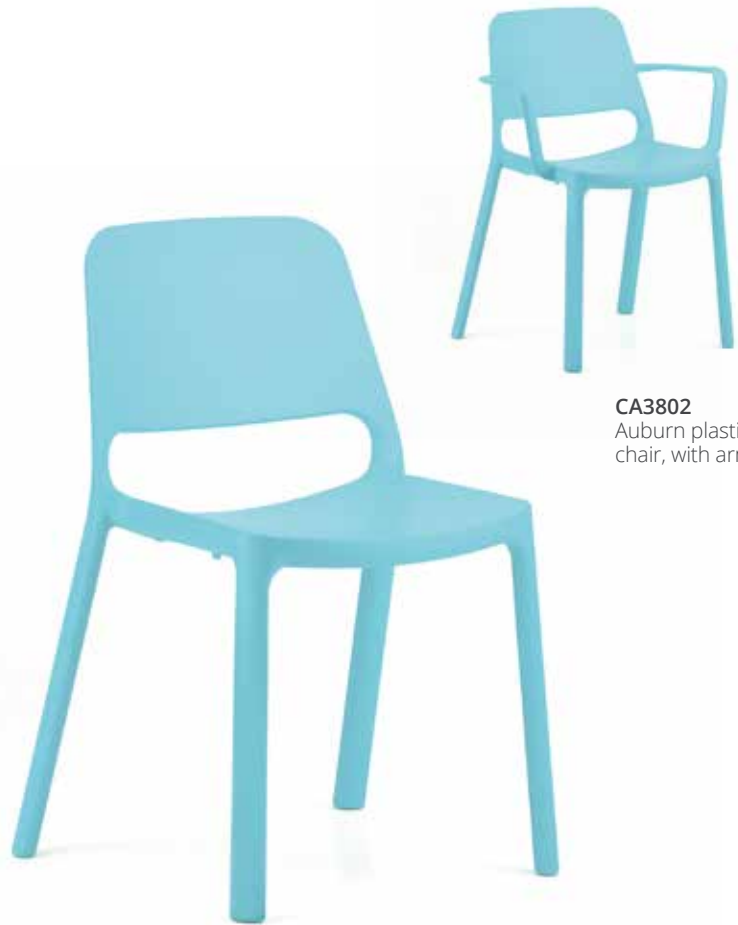
CA3802 Auburn plastic chair, with arms

Designed for both indoor and outdoor environments with UV-resistant technology, the Auburn is a fully polypropylene modern four leg stacking chair. Distinctive in looks, the Auburn can stack up to 6 chairs high and is 100% recyclable. Available in an array of colours to suit multifunctional environments, with the option to have with or without arms, resulting in the ultimate plastic chair.