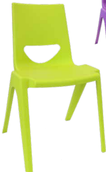
CA3806 Atmore plastic chair