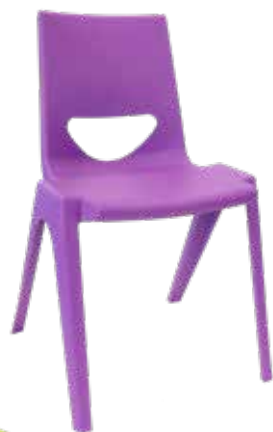
CA3805 Atmore children's plastic chair

Sleek and simple in its design the Atmore is a multi-purpose polypropylene chair that can stack up to 21 chairs high. Environmentally friendly, the Atmore uses fewer materials than any other in its class and is fully recyclable. Functional in its appearance and completely made from reinforced polypropylene the Atmore offers complete strength and durability with a weight capacity of 150kg however, is lightweight resulting in easy mobility. There is a secure linking device option which enables the chair to securely be linked together to cater for all environments. Fully washable and easy to clean with no parts to maintain.