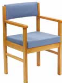
CA3185 Arran patient chair with armrests