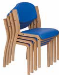
CA3171 Shuna patient chair, stackable up to five chairs