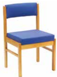
CA3181 Arran patient chair without armrests