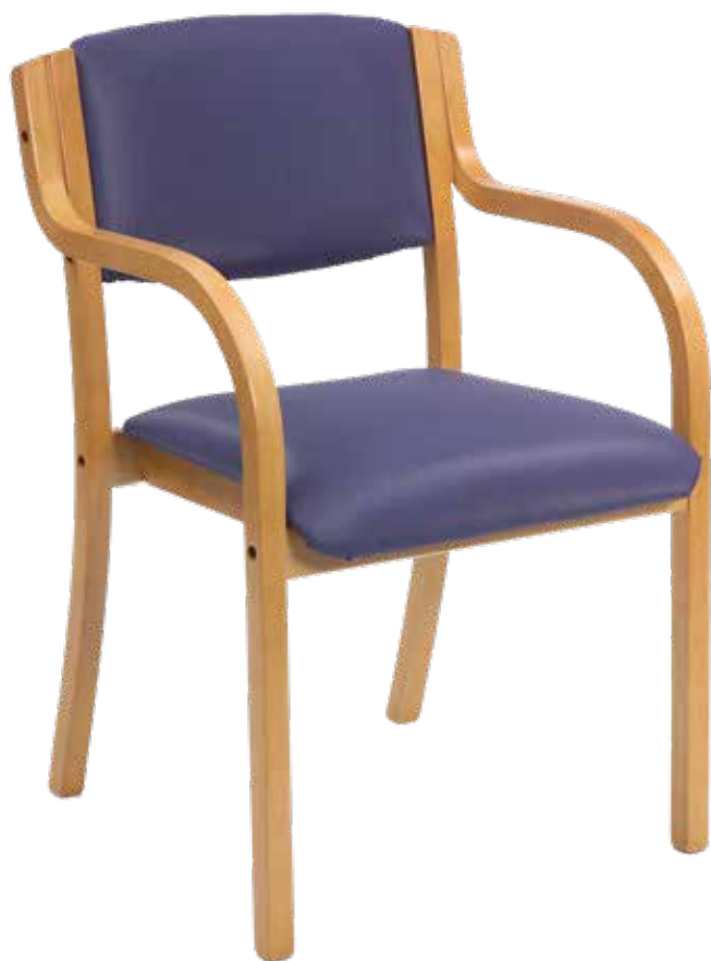
CA3175 Shuna patient chair with armrests

In addition, the Arran side chair has a traditional designed wooden frame available with or without arms. Available in both beech and walnut.