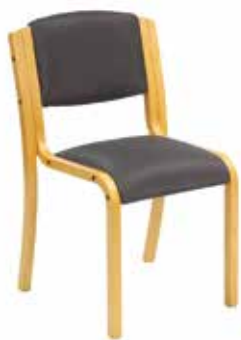
CA3171 Shuna patient chair without armrests